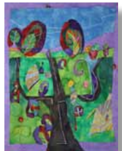
Off a Maine Road by Miles Batt