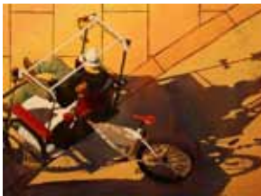
Waiting for a Fare by Cole Wolford