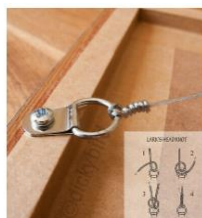
All work MUST be ready to hang with a hanging wire.