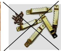
NO SAWTOOTH HANGERS