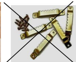
NO SAWTOOTH HANGERS