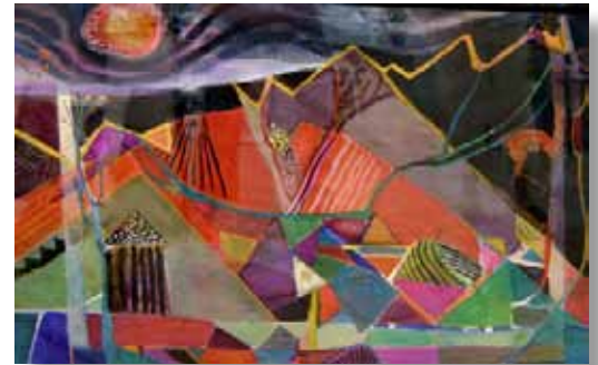
Taos, Eleanor Clarke Lilian Feldman Award Best Of Show, Florida Focus Exhibit 2013

Also, plan now to enter the For the Love of Watercolor Show (Valentine theme) immediately following the Florida Focus Show at the Library. Artists can leave their Focus paintings in or bring in new paintings (limit 2 paintings per artist). There will be no entry fee show and no awards for this show. It's just another chance to showcase our artwork to everyone. Take down for this show will be Monday, February 24 from 10:30-11:30 a.m.