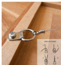
All work MUST be ready to hang with a hanging wire.

Value: $ _____ For Sale _____ Not For Sale _____