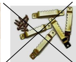
NO SAWTOOTH HANGERS