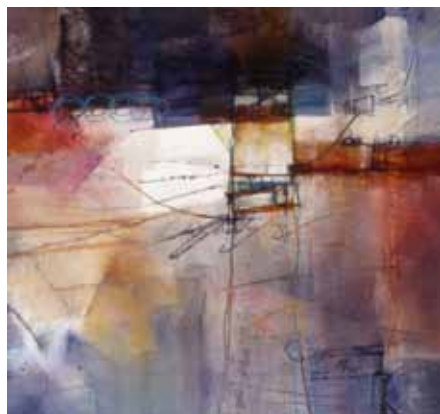
Carol Frye January 20-24, 2014

Thank you to everyone who participated in our 2013 Workshops! Be on the look out for details about our 2014 Workshops! They promise to bring creativity to its peak. Save the dates for our exciting 2014 workshops: