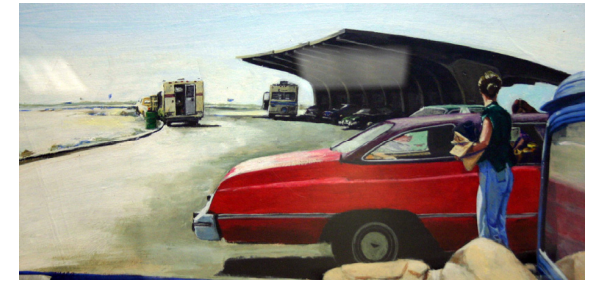
"The Great Salt Lake" by Angie Riserbato