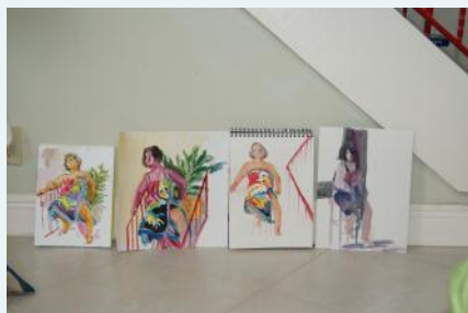
The Results of the day