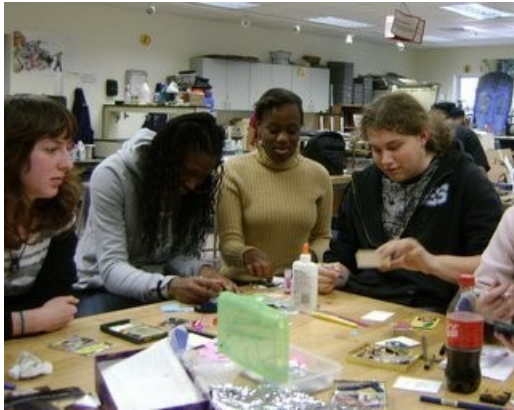
Dillard art students on Artist visiting day creating Artist Trading cards.